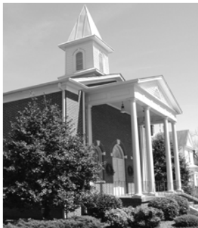
Park Street Campus 107 South Park St

U.S. POSTAGE PAID NONPROFIT ORGANIZATION PERMIT NO. 3 DAHLONEGA, GA 30533