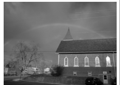
Chestatee Street Campus 199 Choice Avenue